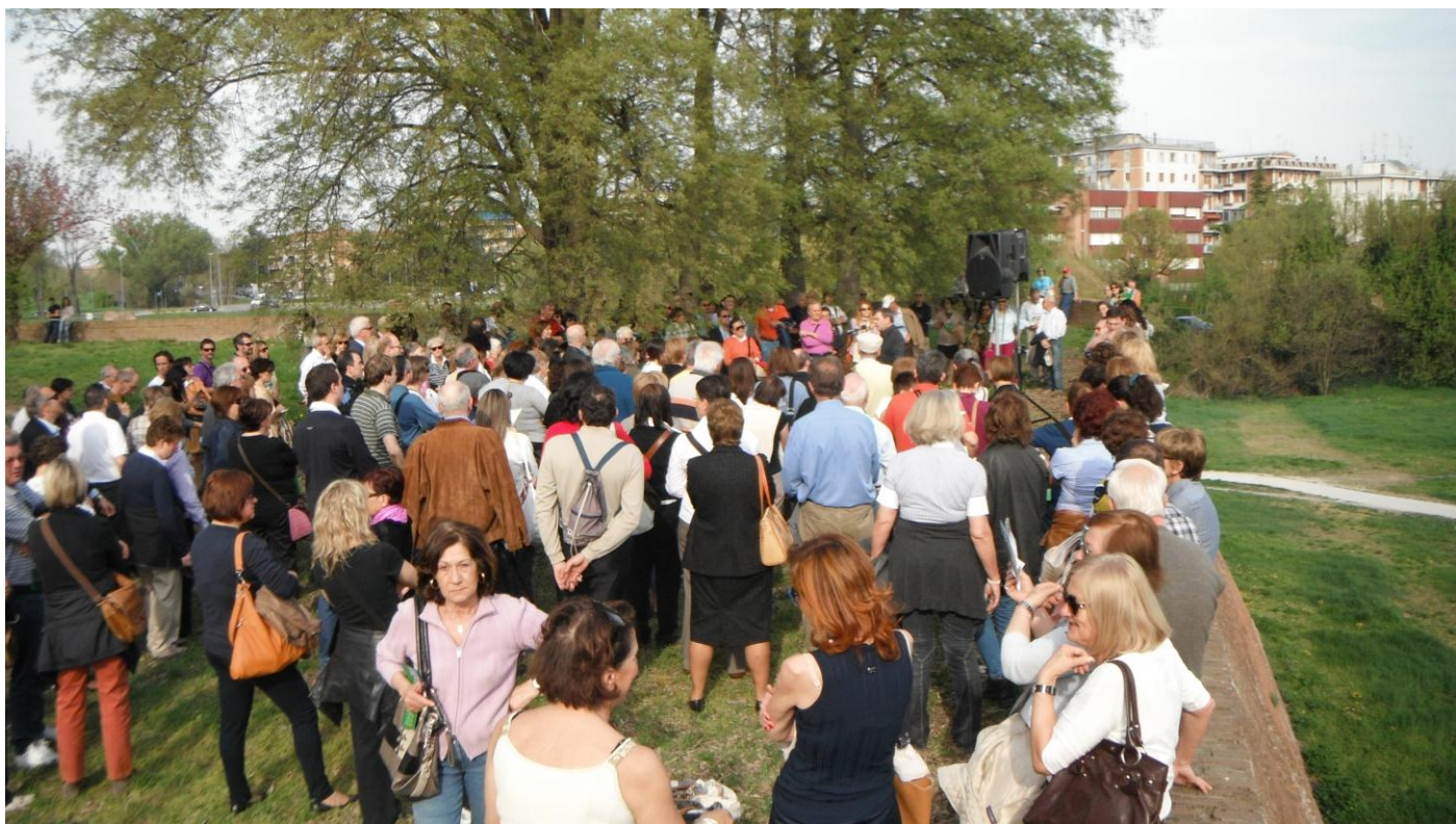
Arrivo al Baluardo di San Tommaso